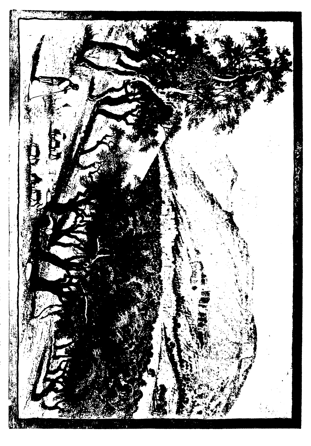
SCHECHEM, BETWEEN MTS. EBAL AND GERIZIM. "A land of hills and valleys" (Deut. 11:11).