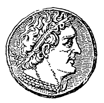
COIN OF PTOLEMY I