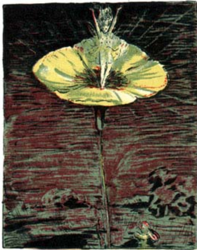
The Fairy Flower

"Little Rabbit," she said, "don't you know who I am?"