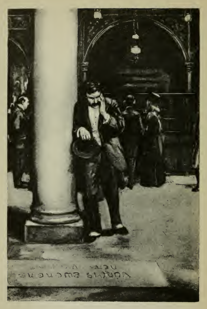
The Tomb of Adam